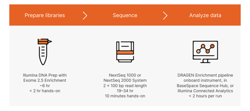
Figure 1: NextSeq 1000 and NextSeq 2000 exome sequencing workflow—The NextSeq 1000 and NextSeq 2000 Systems are part of a simple, integrated NGS workflow that delivers highly accurate exome sequencing data. Times vary by experiment and assay type.