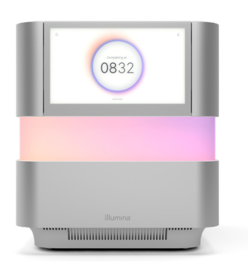
Figure 2: NextSeq 1000 and NextSeq 2000 Sequencing Systems— The NextSeq 1000 and NextSeq 2000 Systems harness XLEAP-SBS chemistry and onboard secondary analysis to streamline sequencing workflows.

RNA-Seg has guickly emerged as the paramount approach to high-throughput transcriptome profiling.<sup>1,2</sup> RNA-Seq provides a detailed snapshot of the transcriptome at a given point in time and offers numerous advantages over quantitative PCR, including: