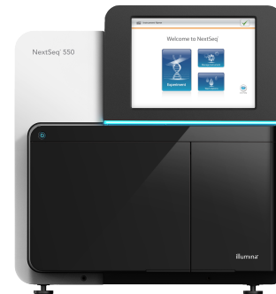
Figure 1: NextSeq 550 System —By leveraging the latest advances in SBS chemistry and user-friendly workflows, the NextSeq 550 System delivers high-quality results for exome, transcriptome, and targeted resequencing applications.