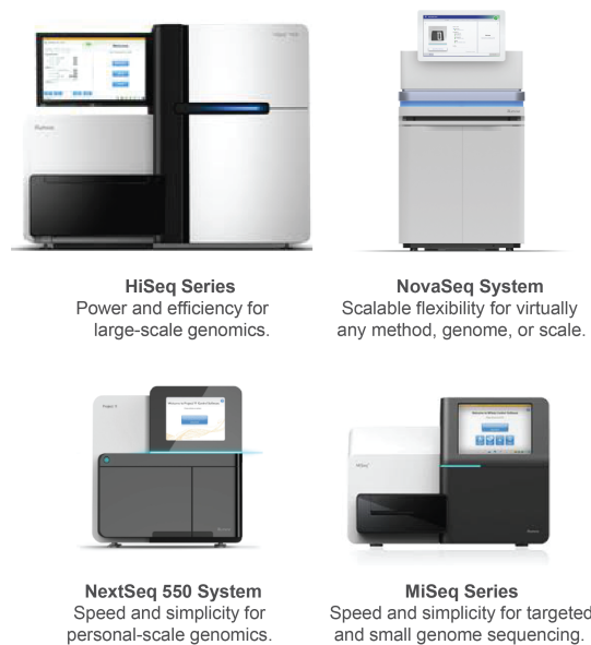
Figure 3: Illumina NGS sequencing systems portfolio —Illumina NGS systems offer solutions for a broad range of applications, sample types, and sequencing scales. Each delivers high-quality data and high accuracy with flexible throughput and simple, streamlined workflows. Data can be seamlessly compared, exchanged, and analyzed in BaseSpace™ Sequence Hub.

At the core of the NextSeq 550 Sequencing System is proven Illumina SBS chemistry—the most widely adopted NGS technology worldwide. 1 This proprietary, reversible, terminator-based method enables the parallel sequencing of millions of DNA fragments, detecting single bases as they are incorporated into growing