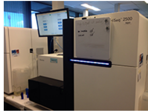
The HiSeq 2500 System in use at the Garvan Institute's Kinghorn Cancer Center.

DT: Based on a published study of environmental and heritable factors, 2 and the analysis of 72 genes in our sarcoma study, I think 1 in 4 people who get sarcoma will be found to have a genetic mutation or mutations that are responsible for it. That's not to say that there aren't environmental influences. The strongest of those is radiation exposure. If a breast cancer patient receives radiation therapy, their risk of secondary sarcoma is much higher. Some of the genes we identified, like ATM and ATR , are directly involved in repairing DNA damage from radiation. So, someone's sarcoma risk from radiation exposure might be affected by the genes they inherit. If they have the ATM or ATR variants we identified, their chance of radiation-induced sarcoma might be much higher than someone who doesn't have those variants.