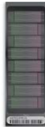
Figure 1: Infinium Global Diversity Array with Carrier Screening Content-8 v2.0 BeadChip —Comprehensive carrier screening analysis for up to 8 samples built on the trusted Infinium assay platform. The BeadChip includes 45K carefully selected markers for expanded carrier screening and dedicated software analysis tools for pan-ethnic, expanded disease coverage in a single assay.

Ethnic-based carrier screening products are estimated to identify only about 30% of the disorders included on expanded carrier panels. 3 The Infinium Global Diversity Array with Carrier Screening Content-8 v2.0 BeadChip contains ~1.87M markers for comprehensive genome-wide coverage. These markers include 45K targeted carrier screening variants covering 602 carrier screening-specific genes, selected in partnership with Igenity, on the Infinium Global Diversity Array-8 v1.0 genome-wide backbone (Table 2, Table 3).