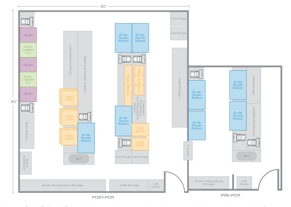
Figure 3: Example lab layout for Infinium XT production-scale genotyping—An example lab layout is provided for processing 1,000,000+ samples per year and includes: three (8-tip) Tecan robots, three iScan Systems, two AutoLoader 2.x units, and ancillary lab equipment. This example layout requires approximately 1200 square feet. Layout is not to scale.

With the high-throughput Infinium XT solution, there is a natural increase in data analysis. With this in mind, several improvements have been made to GenomeStudio<sup>™</sup> Software and Beeline Software. GenomeStudio Software is the Illumina visualization and analysis program for microarray-based genotyping data. It provides a tabular view for quickly accessing all the data in an experiment and allows data to be exported for use by various third-party applications. The GenomeStudio Genotyping Module supports analysis of Infinium array genotyping data with normalization, genotype calling, clustering, data intensity analysis, and more. In addition, GenomeStudio Software is necessary for creating and modifying clusters used for calling genotypes from scanned microarray signal intensities. GenomeStudio 2.0 Software speeds up genotype cluster generation, reducing the overall analysis turnaround time. Also, the Polyploid Genotyping Module is appropriate for agricultural and other applications involving polyploid organisms (Figure 4). When used in tandem with Illumina LIMS, GenomeStudio Software provides an integrated experience to view and analyze data from processed samples in real time.