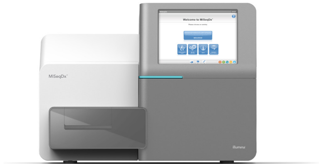
Figure 1: MiSeqDx Instrument—The FDA-regulated, CE-IVD–marked MiSeqDx Instrument offers a simple workflow, user-friendly software interface, and enhanced user security.

The MiSeqDx Instrument is the first Food and Drug Administration (FDA)–regulated and Conformité Européenne in vitro diagnostic (CE-IVD)–marked platform for next-generation sequencing (NGS) (Figure 1). Designed specifically for the clinical laboratory environment, the MiSeqDx Instrument offers a small footprint (0.3 square meters), an easy-to-use workflow, and data output tailored to the diverse needs of clinical labs. In addition, the on-instrument integrated software enables run setup, sample tracking, user management, audit trails, and results interpretation.* Taking advantage of proven Illumina sequencing by synthesis (SBS) chemistry, the MiSeqDx Instrument provides accurate, reliable screening and diagnostic testing.