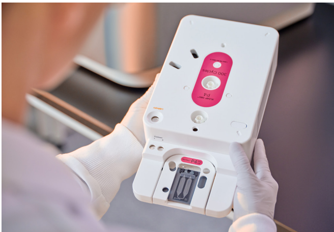
Figure 3: NextSeq 1000 and NextSeq 2000 reagent cartridge—The integrated cartridge includes reagents, fluidics, and the waste holder. Simply thaw and prepare the reagent cartridge, insert the flow cell, load the library, and place into the instrument.

Reagents never leave the cartridge, resulting in a dry instrument design that does not require washing, enables streamlined instrument maintenance, and optimizes instrument efficiency.