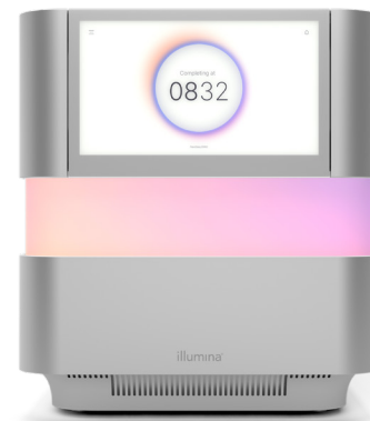
Figure 1: The NextSeq 2000 Sequencing System—The NextSeq 2000 System offers innovative design features, advanced chemistry, simplified bioinformatics, and an intuitive workflow that enable the widest range of applications and flexibility of scale on a benchtop sequencing system.

The NextSeq 1000 and NextSeq 2000 Systems are powered by XLEAP-SBS chemistry, a faster, higher quality, and more robust SBS chemistry built on the proven foundation of standard Illumina SBS chemistry. XLEAP-SBS nucleotides use state-of-the-art dyes and novel linkers and blocks that are more resistant to heat, show a 50× reduction in hydrolysis, and 2.5× faster block cleavage to reduce phasing and prephasing. The XLEAP-SBS polymerase is engineered to incorporate nucleotides faster and with higher fidelity than ever before.